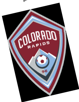
Soccer Game Tickets